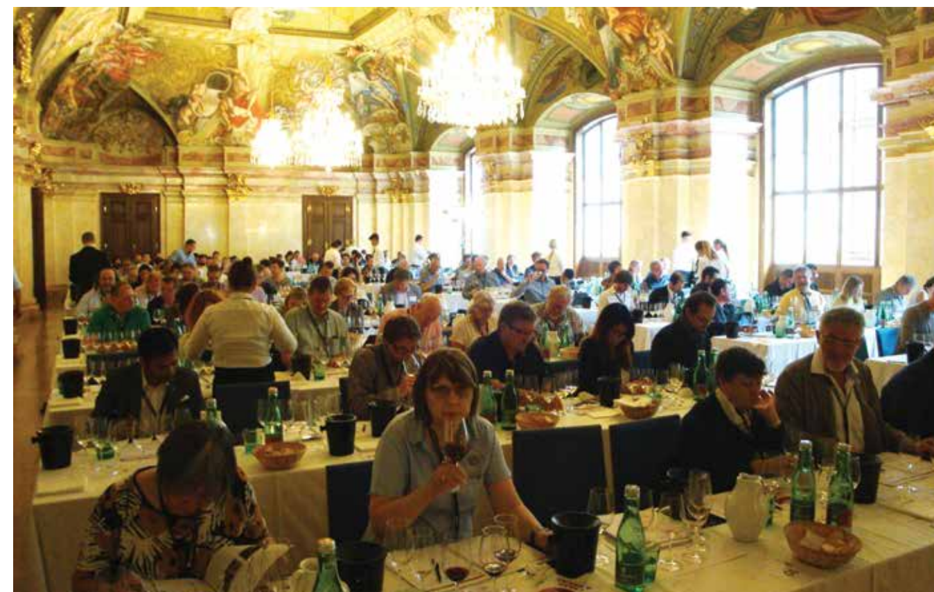
Salon wines tasting in progress