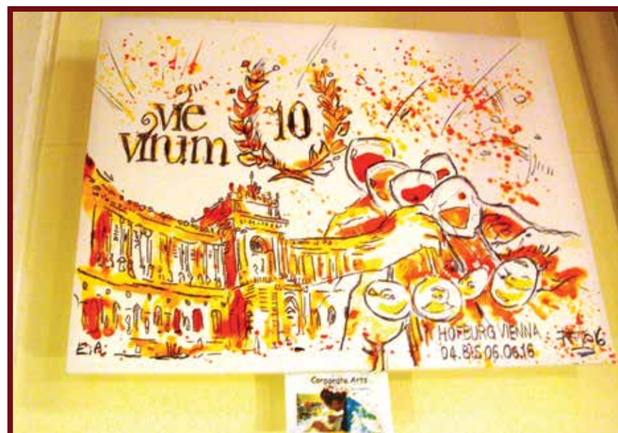
An artist's creation to celebrate the 10th edition of VieVinum

The expansive interiors, spread across two floors of the magnificent Hofburg Palace, provided ample space for producers to showcase their products and organise discussions. For visitors,